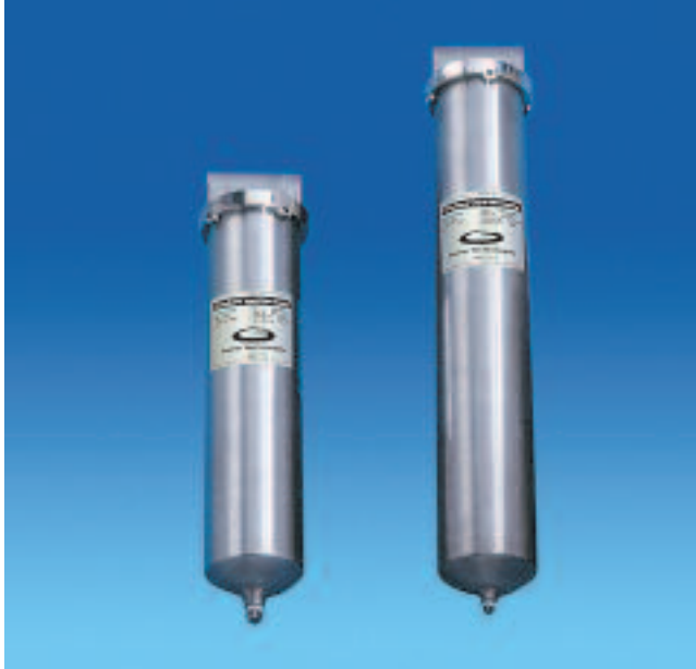
SCR Ring Closure Housing