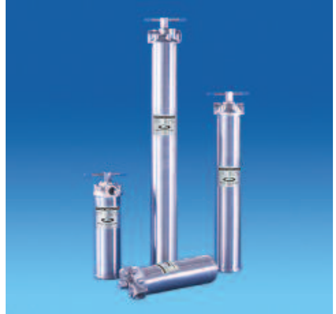
SCB Bolt Closure Housing