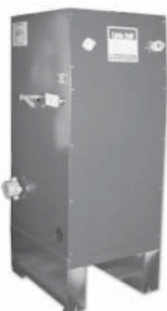
Vacuum attachment for LS55 shown here