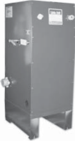
Vacuum attachment for LS55 shown here